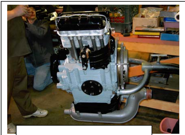
OVWC Raffle Engine2008

Send checks to: Rob Laffoon 4974 Corby Street Omaha, NE 68104-4467